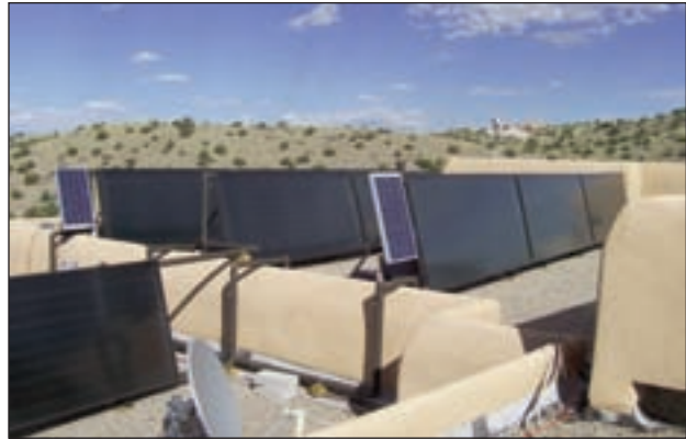
Figure 16-1. Rooftop collectors of a combi-system.

safe high-limit temperature (e.g. 180-200 F).